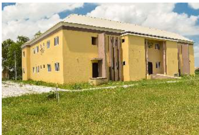
Postgraduate Hostel, New Campus