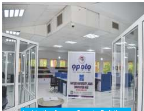
Inside the former Senate Building