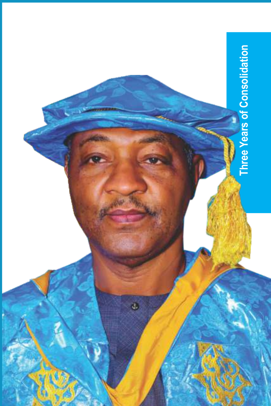
Three Years of Consolidation

This report will also cover only a few important events that happened over the last twelve months, such as the 36 th & 37 th combined Convocation and the investiture of the former Chancellor of the