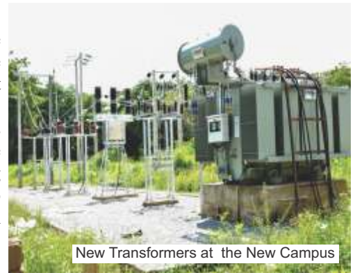
New Transformers at the New Campus

As part of management's effort in ensuring an adequate power supply for the University, the University secured the intervention of transformers from the Federal Ministry of Works and Housing. The Ministry awarded the contract for the provision/installation of 7.5MVA, 33KV/11KV and 5.0MVA, 33KV/11KV injection substation in the University. The Ministry of Works and Housing did all these under its 2021 Special Intervention projects. The Vice Chancellor has already announced that the Bill of Engineering Measurement and Evaluation for Injection Substation for Bayero University had been approved (as published in Federal Tenders Journal on Monday, 30 th May, 2022). The installation has been completed. The University is currently discussing with KEDCO to put them to use.