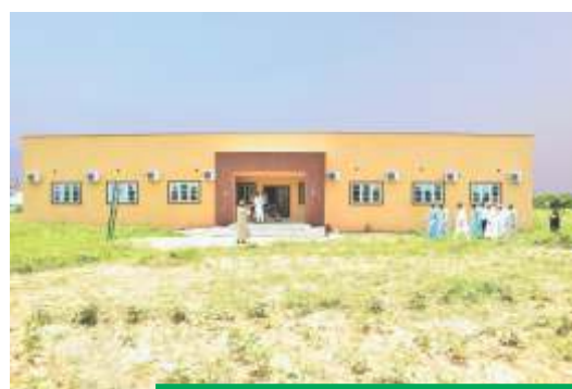
Animal Husbandry and Veterinary Care